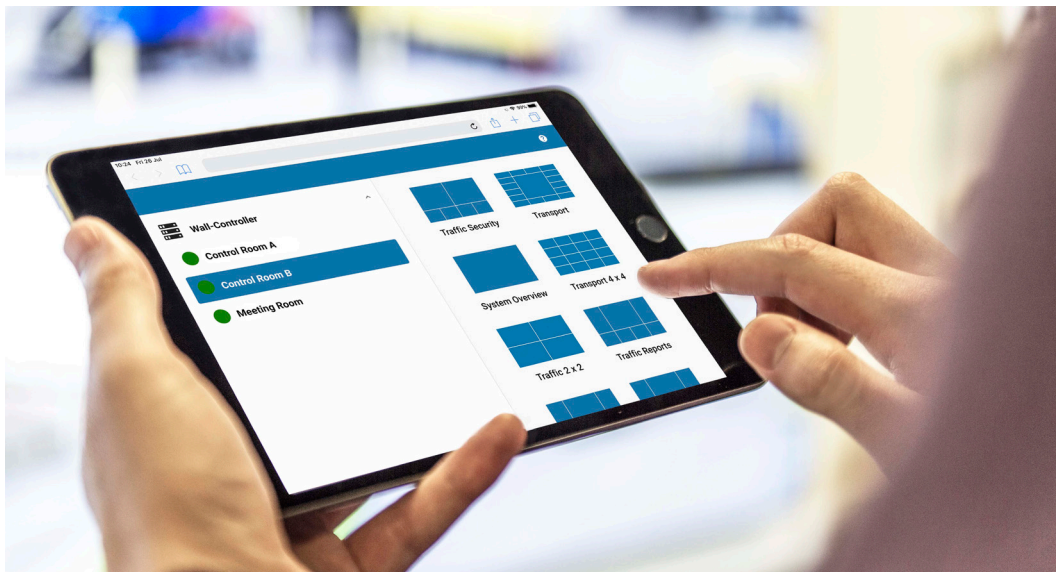
Layouts can be accessed via the web interface