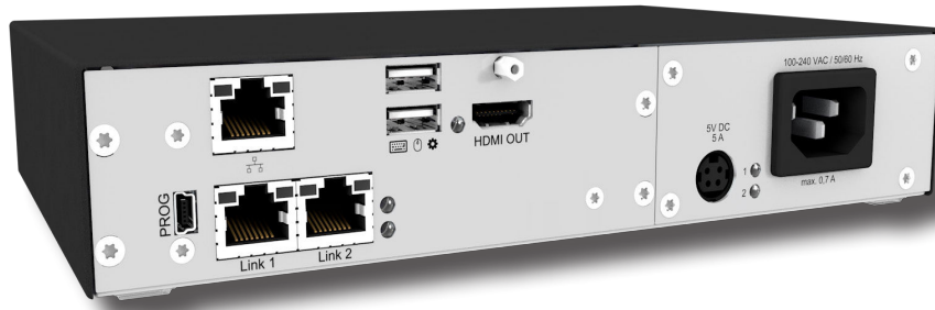
R488-BIPCR in 474-BODY2BPF